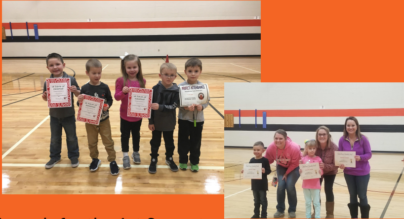
Awards for the 1st Semester